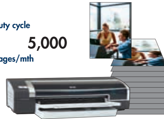
Up to 5,000 pages/month duty cycle