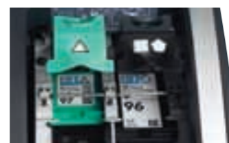
Optional 6-ink printing for rich, vibrant colours