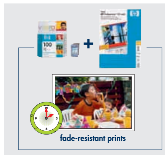
Specially formulated HP Vivera fade-resistant inks for fade-resistant prints