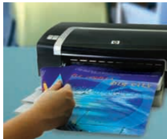
Wide-format optional auto-duplexer enables production of professional, impactful documents and collateral