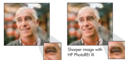
Sharper images with 4800 x 1200-optimised dpi resolution