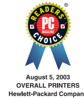
Clinched the top spot for 13 consecutive years 1